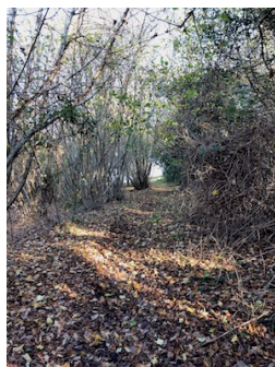
Coppiced woodland between A and B