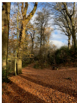
Glorious beech wood by the bench at C