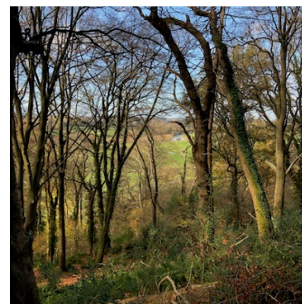
Glimpse of the Avon through the trees