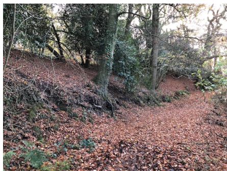
Left: the southern rampart of Frankenbury hill fort.